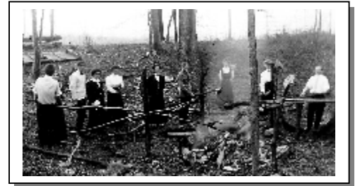
A chicken roast in Bloomfield's woods, circa 1909.

The night was sharp and clear and a heavy frost set in. The men sang hymns and popular songs until time to go for the return train at 11:45 P.M. At least a third of them caught [sic] the "grippe" or some kind of ailment that kept them at home for 1 or 2 days.