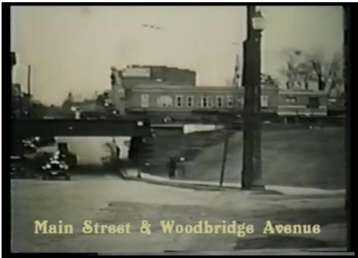
Main Street & Woodbridge Avenue